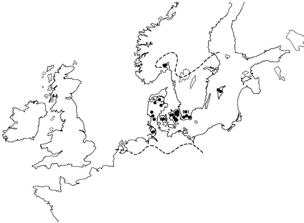
Map 6. The find context for gold bracteates. 1. depot, 2. grave, 3. approximate limit between depots and graves.