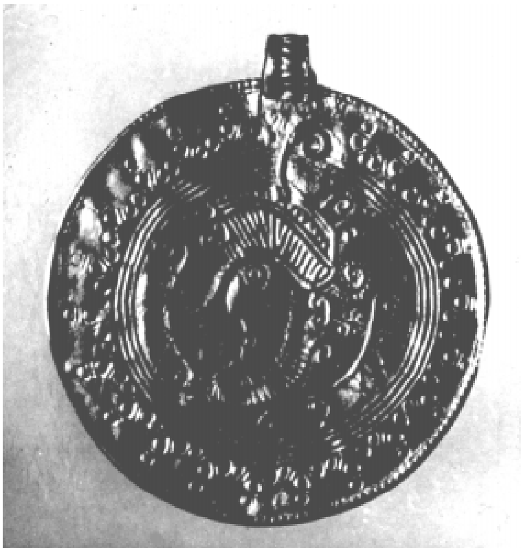
The Hitsum bracteate.

referring to the supposed preserving qualities of the combination of linen and garlic, as is suggested in the Völsa þáttr (see Krause 1966:85f.). laukaz is connected with fertility, sexuality, invocations and charms (Heizmann 1992:375 with ref.). Thus, Krause (1966:246f.), Antonsen (1975:63) and several others have proposed the intrinsic meaning 'prosperity'. Garlic was used as an antidote or medicine (cf. Saltveit 1991:138). laukaz is sometimes accompanied by other words, and appears (also abbreviated) on relatively many bracteates: Års (II)-C (IK 8), Skrydstrup-B (IK 166), Börninge-C (IK 26), Schonen-(I)-B (IK 149), and also on the FLØKSAND scraper. Shortened on: Danmark (I)(?)-C (IK 229), Seeland (I)-C (IK 330), Allesø-B , Bolbro (I)-B and Vedby-B (IK 13, 1, 2 and 3), also on Hesselagergårds Skov-C , Hesselager-C , Südfünen-C (IK nrs. 75,1, 2 and 3), Maglemose (II)-C (IK nr. 301), Lynge Gyde-C (IK nr. 289), and Hammenhög-C (IK nr. 267); maybe on Nebenstedt (I)-B (IK 128). Uncertain is: RYNKEBYGÅRD-C (IK 147: lzolu ).